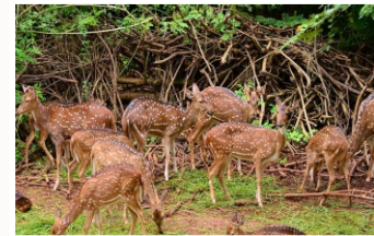
Birsa Zoological Park