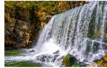
Panch Gagh Falls