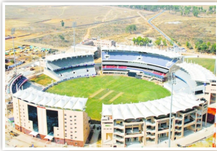
JSCA International Cricket Stadium Complex